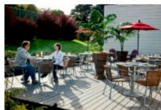
Presidio Social Club In the know in San Francisco.