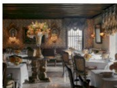
Club del Doge, Gritti Palace Venice Down by the canal.