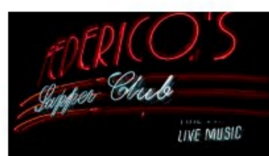
Federico's Supper Club Dine and dance.